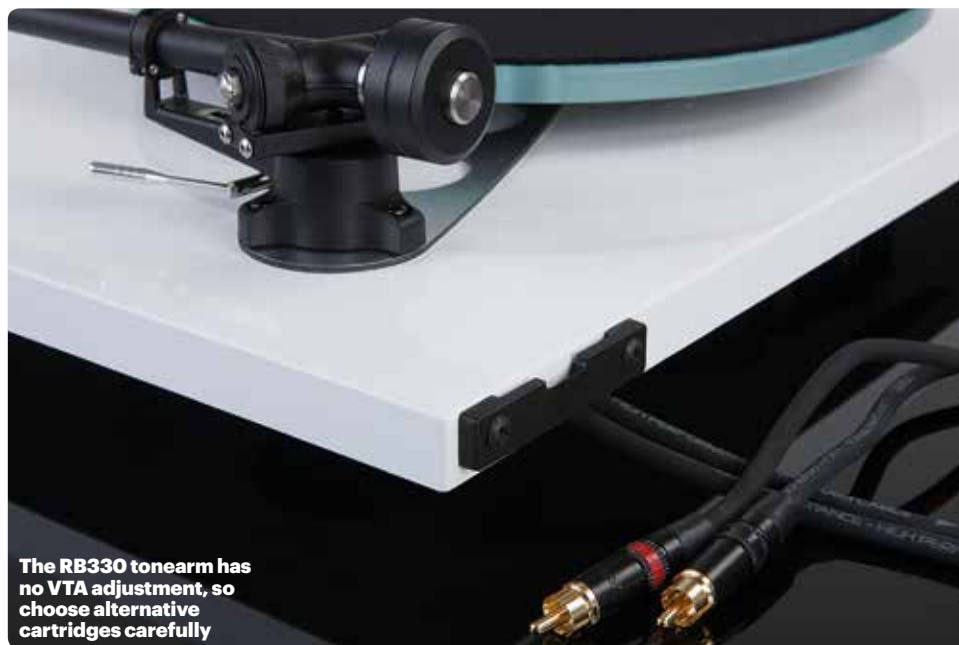
The RB330 tonearm has no VTA adjustment, so choose alternative cartridges carefully

the stiffer plinth, the Planar 3 is considerably more inert than any previous version, which should audibly reduce distortion.