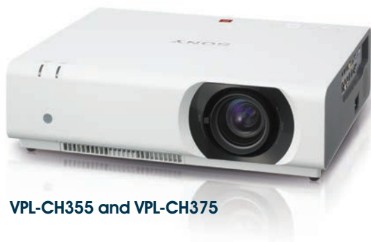
VPL-CH355 and VPL-CH375

When it comes to equipping medium to large-sized classrooms or meeting rooms, cost is critical. The VPL-CH355 and VPL-CH375 are a cost-effective choice with no compromise on picture quality.