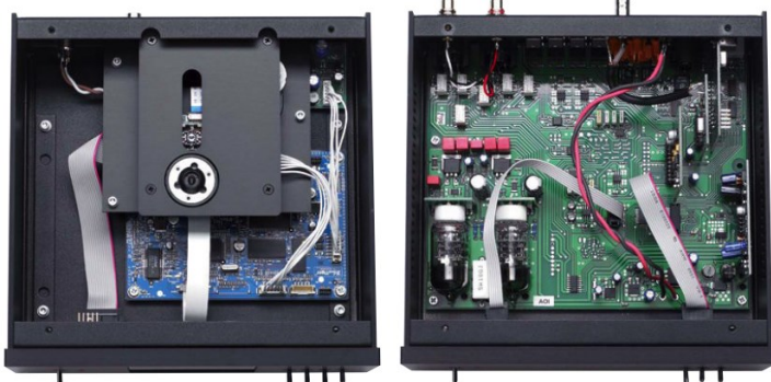
Weil das Laufwerk (links) neben üblichen Audio-CDs auch CDDAs oder CD-ROMs mit MP3- oder FLAC-Files (bis 24/96) abspielen kann, hat es eine eigene Hardware-Decoder-Plattform an Bord (Blue Tiger CD 100), die auch gleich für das (zuschaltbare) zwei- oder vierfache Daten-Upsampling zuständig ist. Der D/A-Wandler (rechts) erlaubt direktes Umschalten beim Hören zwischen Röhren- und Transistor-Ausgangsstufe.