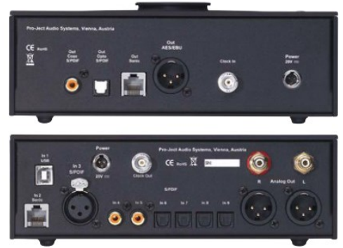
Sowohl das Laufwerk (oben) als auch der Wandler bieten digitale Anschlüsse in Hülle und Fülle. Die Sonic-Digitalverbindung erfordert neben dem RJ-45- auch noch ein BNC-Kabel für das Clock-Signal. Die Netzteile beider Geräte sind ähnlich wie bei Laptops ausgelagert.